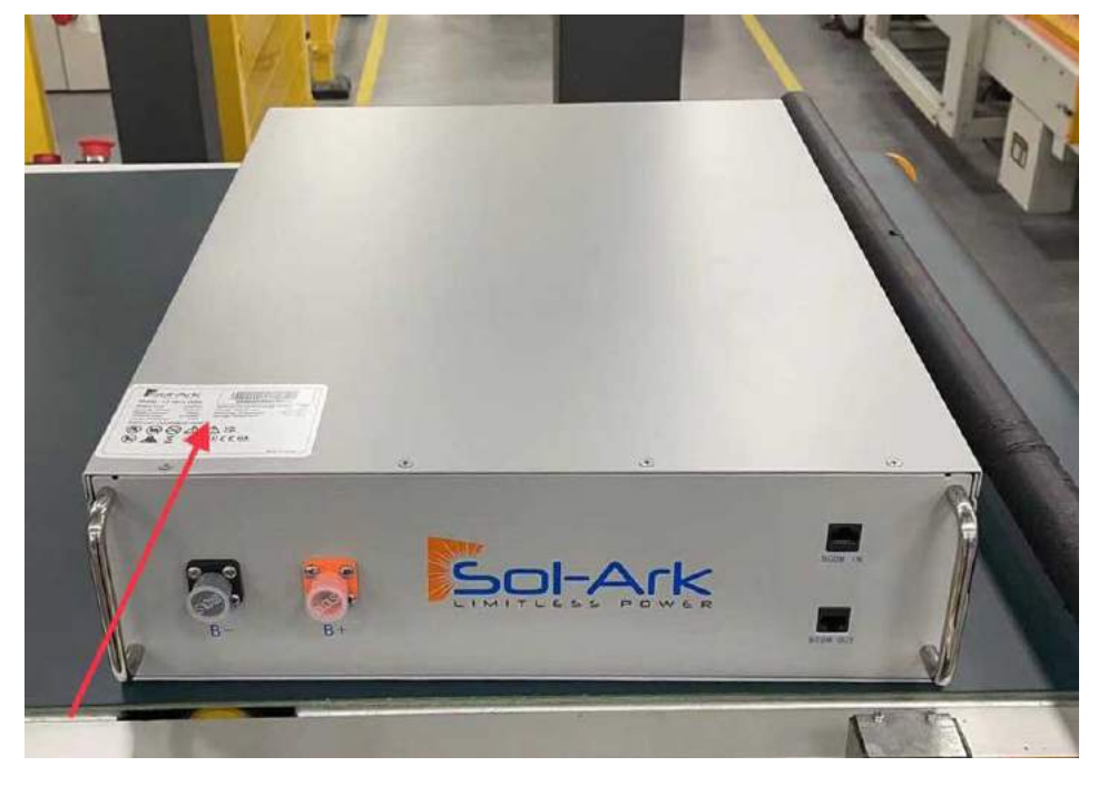
Figure 3: External View the L3 HV Battery Module

The following photos depict the location of the aerosol canister inside the battery cabinet or module.