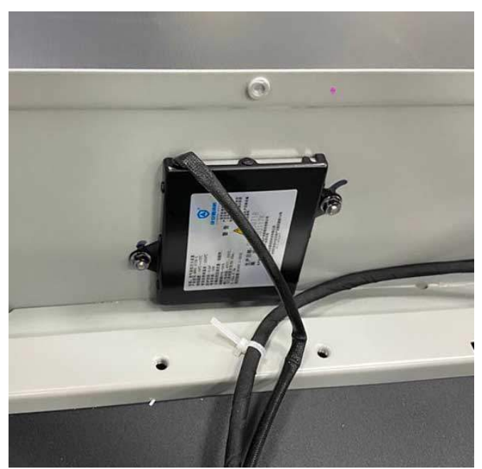
Figure 5: Closeup of the Module Aerosol Canister