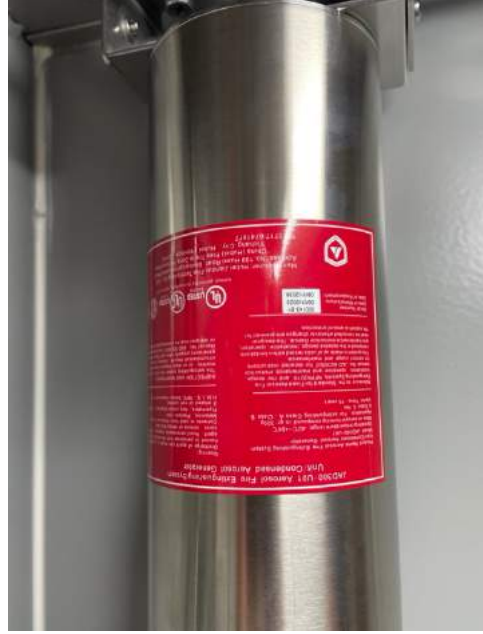
Figure 4: Closeup of the L3 HVR Aerosol Canister